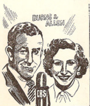
Burns & Allen-$3.75