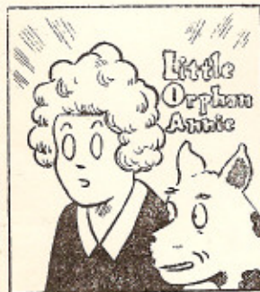
Little Orphan Annie-3.75